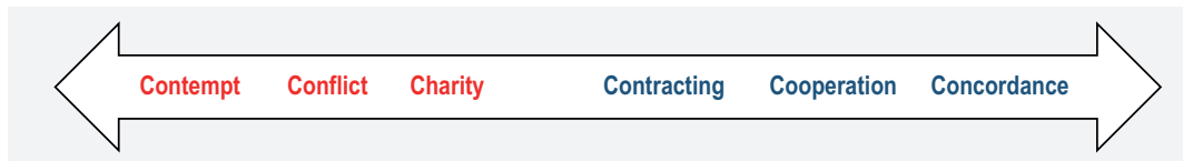
FIGURE 2 CLASSIFICATION OF GOVERNMENT – NONPROFIT PARTNERSHIPS

As a proposal to simplify this classification, using Coston (1998) and Furneaux & Ryan (2014), we have produced the following scheme: